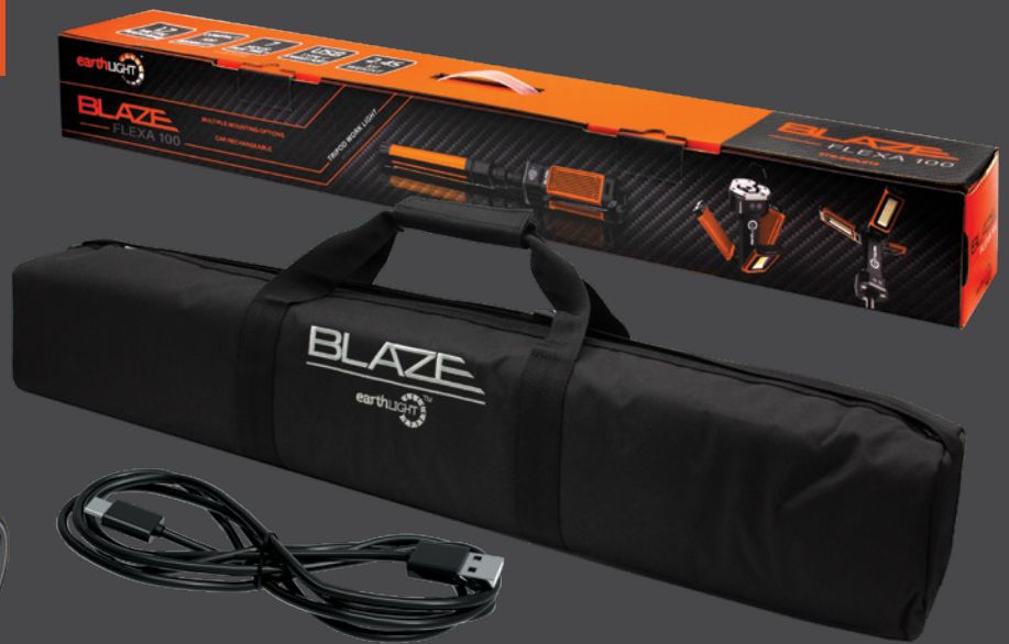
WATER RESISTANT CARRY BAG