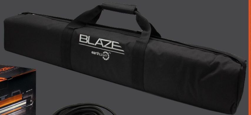
WATER RESISTANT CARRY BAG